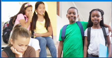
Bystander vs. Upstander